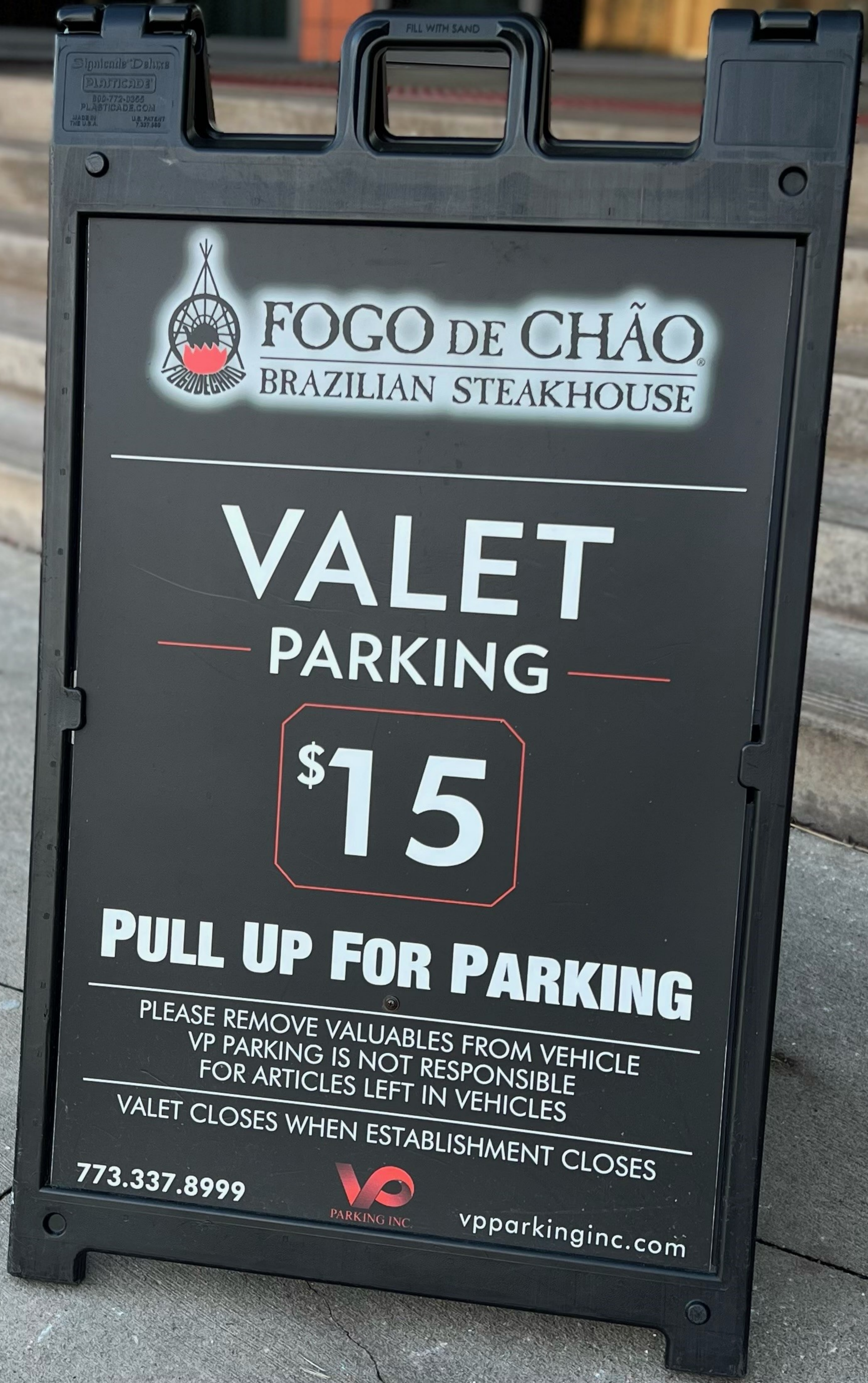
VALET PARKING A-FRAME SIGN