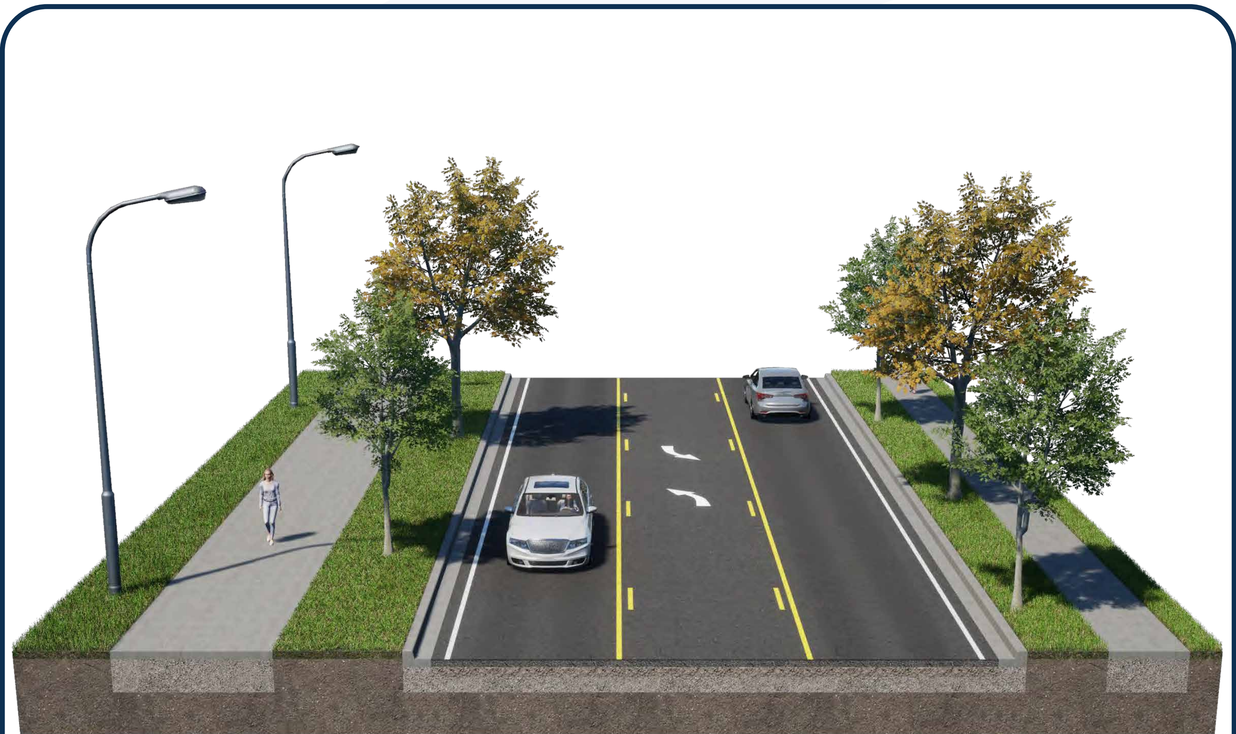
Crest Road to Wise Road Looking North