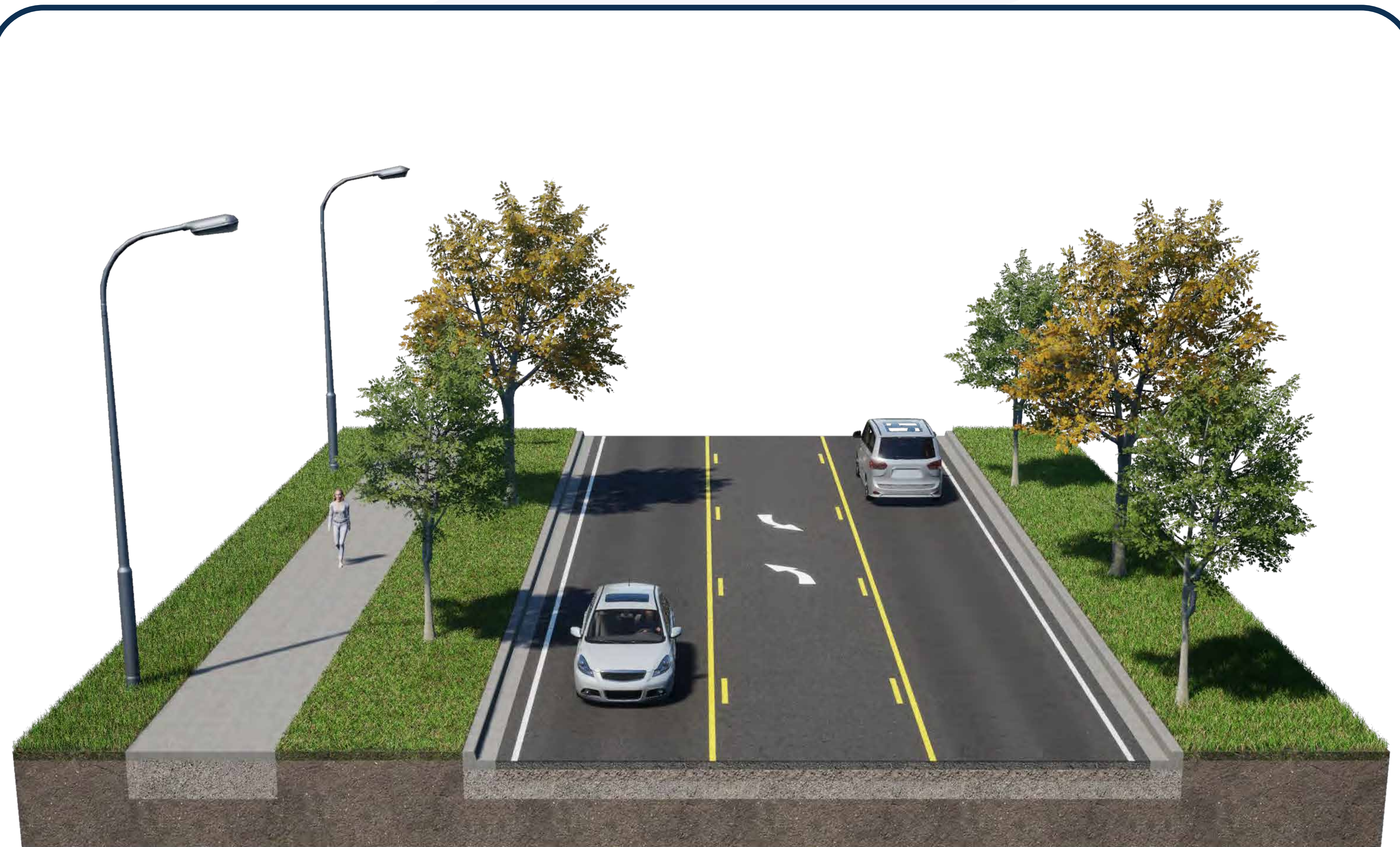
Crest Road to Wise Road Looking North